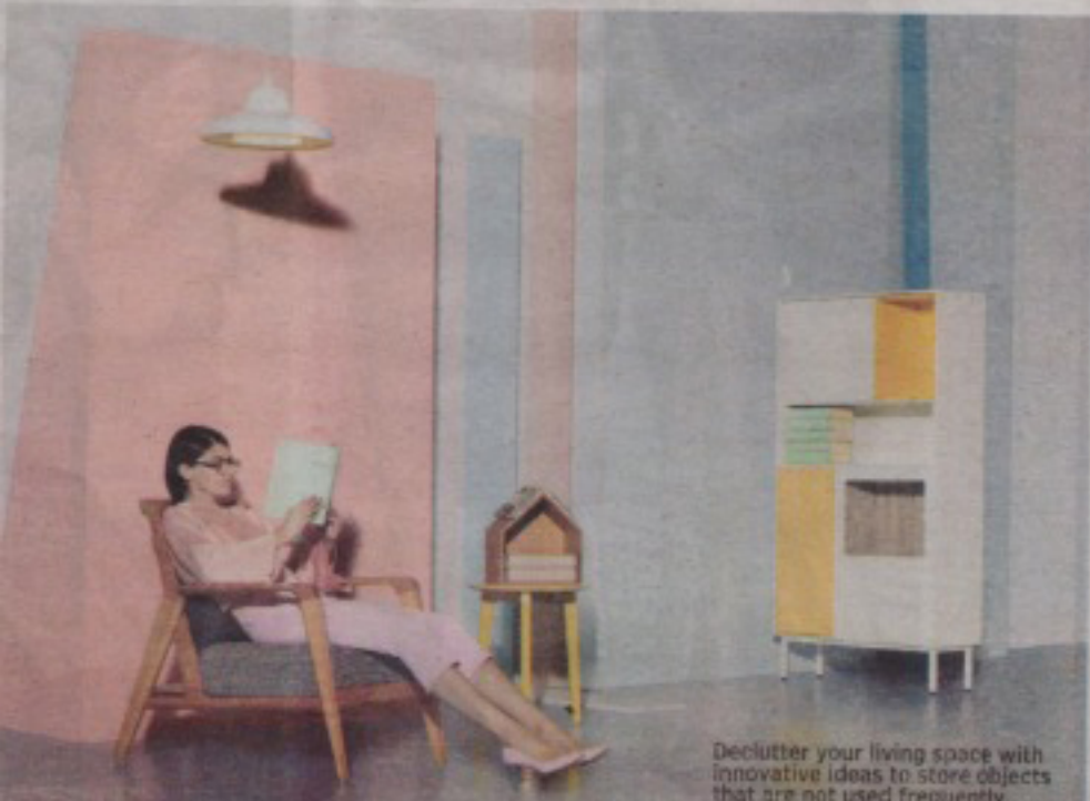
Declutter your living space with innovative ideas to store objects that are not used frequently